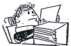
FROM THE PASTOR'S DESK.

A warm and heartfelt THANK YOU to all the parishioners who happily participated in our Parish Praznyk last Sunday. And a special 'thank you' to all the volunteers who made it so successful – be it in the kitchen, or the bbq or setting up the tent and all the tables for a sunny outdoor picnic! Alas! The weather was not conducive but still a picnic atmosphere was definitely created in our hall. God bless you all!