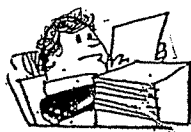
From the Pastor's Desk

May this weekend ( please! ) be the beginning of Spring and that we will finally be blessed with warm weather! My garden is waiting!!!