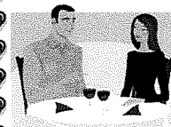
Table for Two ~ Saturday Feb. 15, 2014 ~ A romantic dinner for young married and engaged couples! 6 pm at St. Joseph's Church Hall, 250 Jefferson Ave. Cost is $40 per couple.

Please reserve your table by February 10 th . Space is limited!